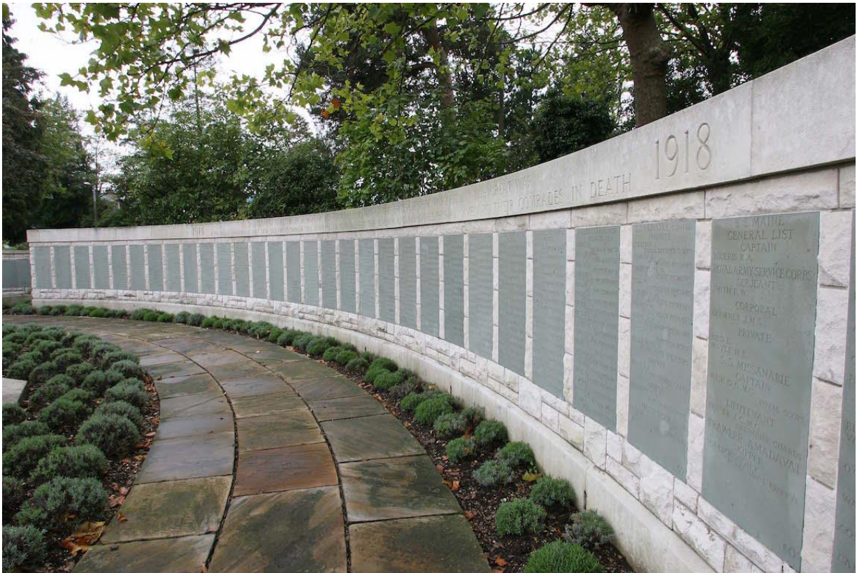
Name Panels behind Cross of Sacrifice